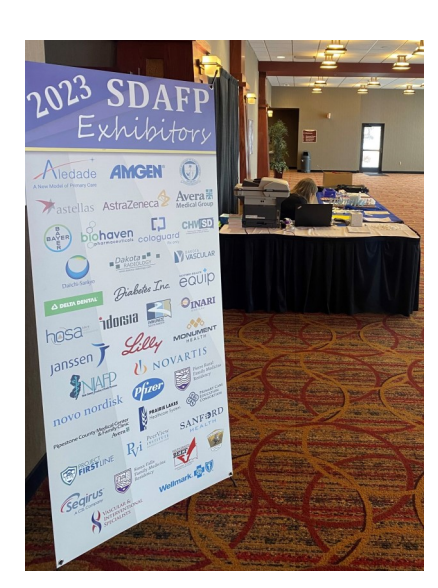
Thank You Sponsors!